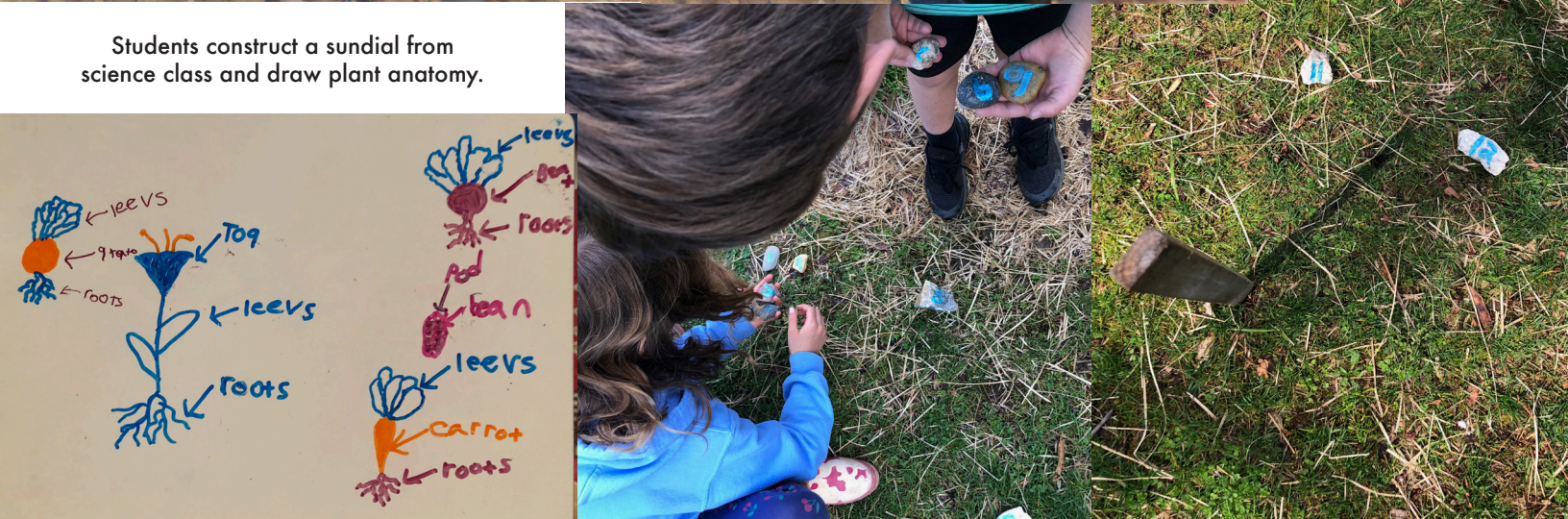
Students construct a sundial from science class and draw plant anatomy.