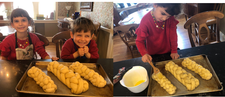
Gorgeous loaves of challah from the Winfields.